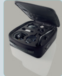
Titan carrying case