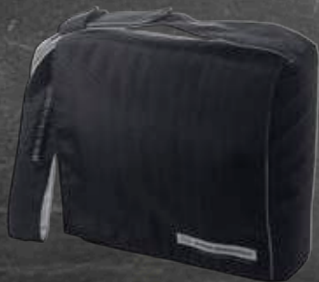
The soft carrying case

The AS608 / AS608e will operate with 3 standard AA batteries or a medically approved external power supply. Typical battery life is six months.