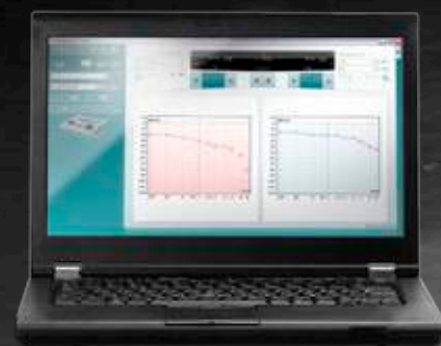
Diagnostic Suite software (AS608e only)